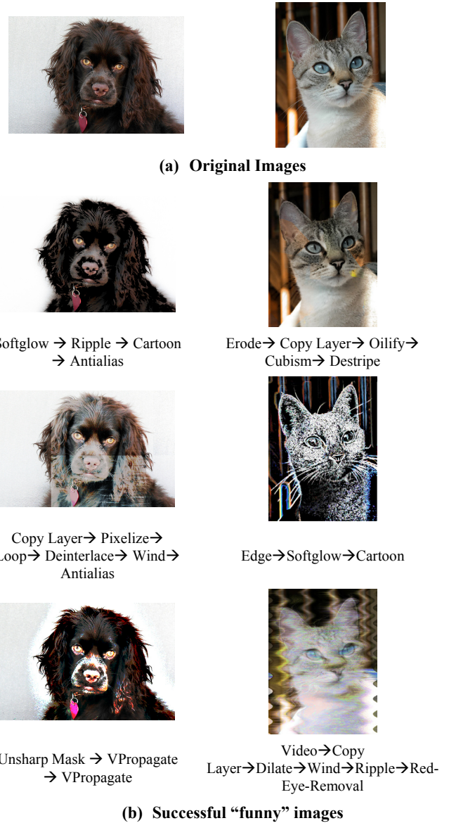
Figure 3. The results of the IGA-based photo retouching system and the evolved sequence of filters applied (the parameters of each filter is not shown)

The average of the maximum over all generation (16 generations) is defined as the sum of scores.)